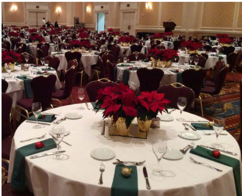
Brightly decorated tables welcomed members and guests to HBB 2016, the 20th Annual Garden Club of Dearborn Fundraiser.