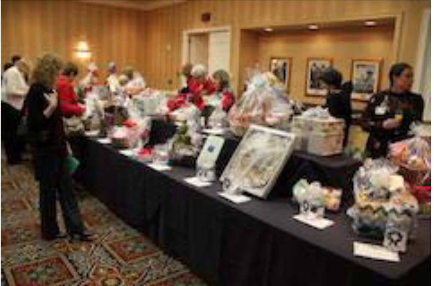
More than 140 Raffle items on display at Dearborn Inn create excitement among HBB 2016 participants.