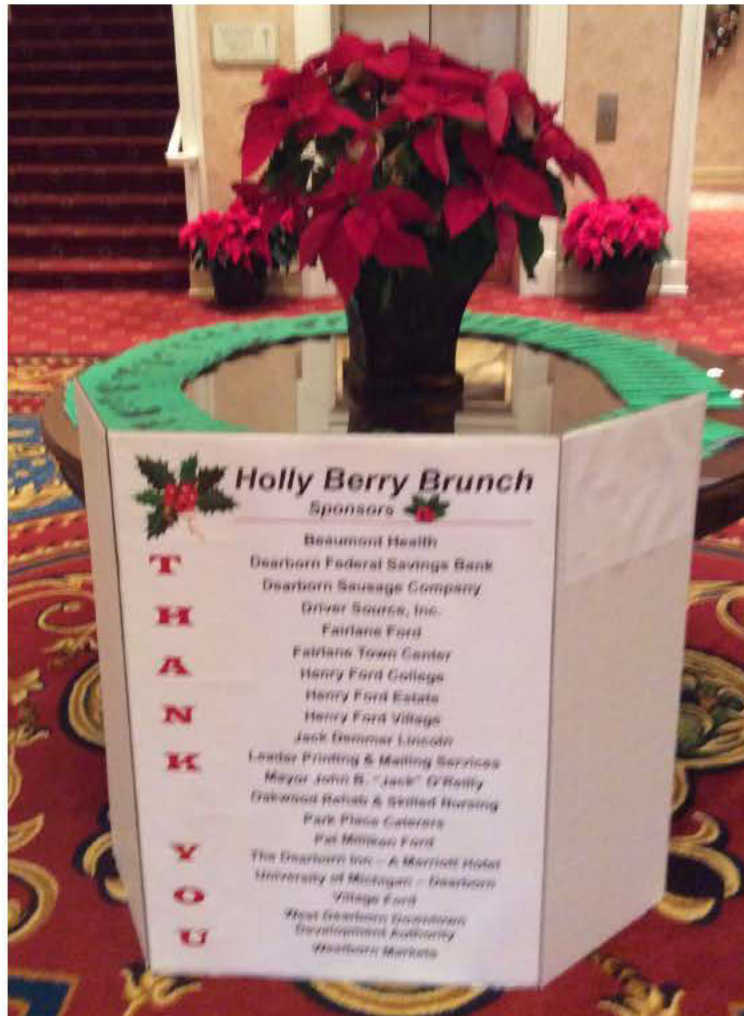
Upper Right: Garden Club of Dearborn thanks HBB 2016 Sponsors